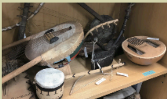
African musical instruments