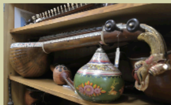
Indian musical instrument