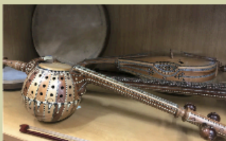
Musical instruments of Xinjiang Uygur Aut. Region