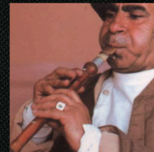
Balababan (Apr 1977, Tehran, Iran)