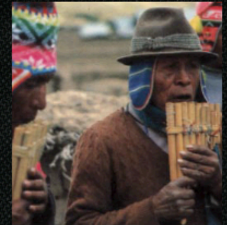
Siku (Feb 1980, Aymara, Bolivia)