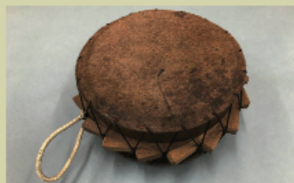
Chijin (Amami, Japan)