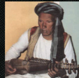
rubab (Mar1974, Kabul, Afghanistan)